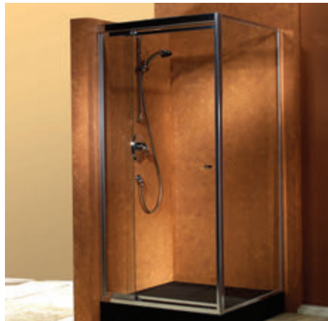
Series 9320 configuration