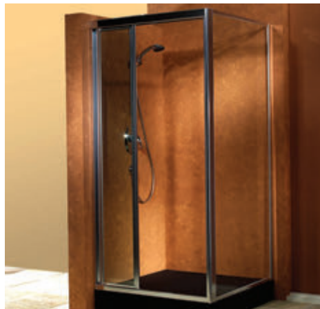
Series 9300 configuration

Smooth, contoured profiles minimise soap and residue accumulation, reducing the need for cleaning.